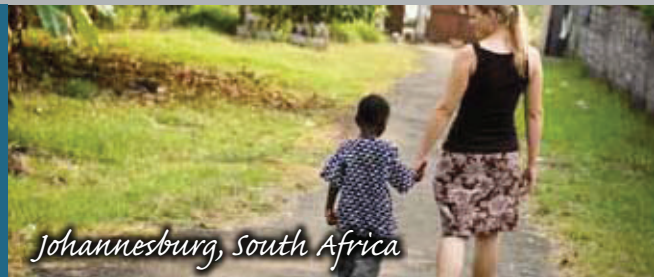
Johannesburg, South Africa

With medical coverage from 5 days to 12 months, Atlas Group Travel from HCC Medical Insurance Services (HCCMIS) is with you almost anywhere on the planet you may travel with a group of 5 or more for mission trips, large family vacations, student groups abroad, corporate groups, and overseas excursions for other large organizations.